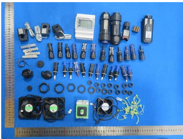
01 Soft plastic